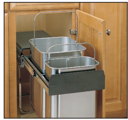
Cans easily remove.